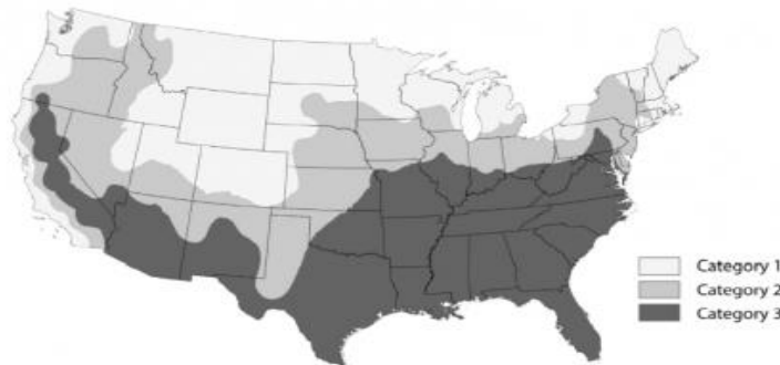
Fig. 2. Heat safety regions.

Below is a heat safety table modeled off the Georgia High School Athletics Association guidelines for environmental modifications. This table, also adopted from Grundstein et al. Regional heat safety thresholds for athletes in the contiguous United States. Appl. Geography. 2015.pdf , provides a guideline for modification of activity based on the environmental conditions in your region.